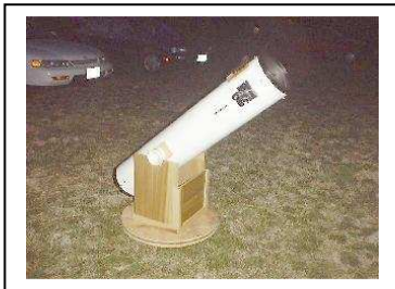
8-inch club scope