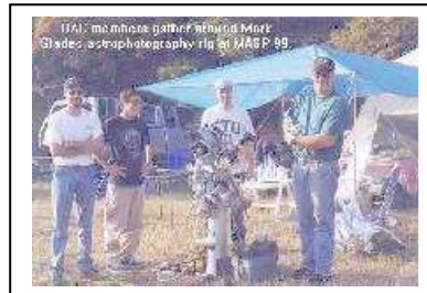
Club members at a starparty